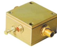
CASE STYLE: Y460