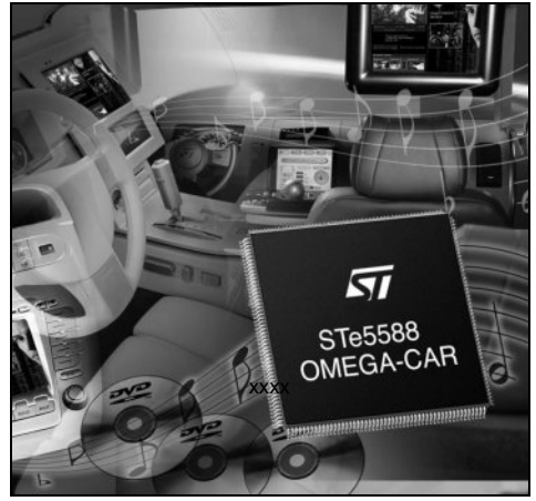
Figure 2. STe5588 OMEGA-CAR solution